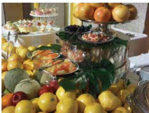
Dessert bar at the reception